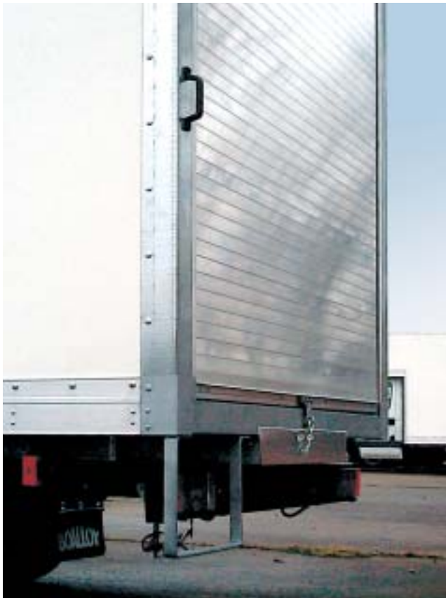
REAR ROLLER SHUTTER DOOR OPTION