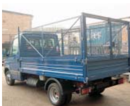
REAR or 3-WAY TIPPER with STANDARD CAB