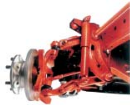
Independent front suspension

Ready for specialist bodies. High strength flat topped frame with body mounting brackets