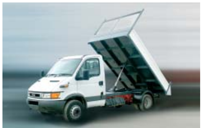
Daily 65C15 REAR STEEL TIPPER