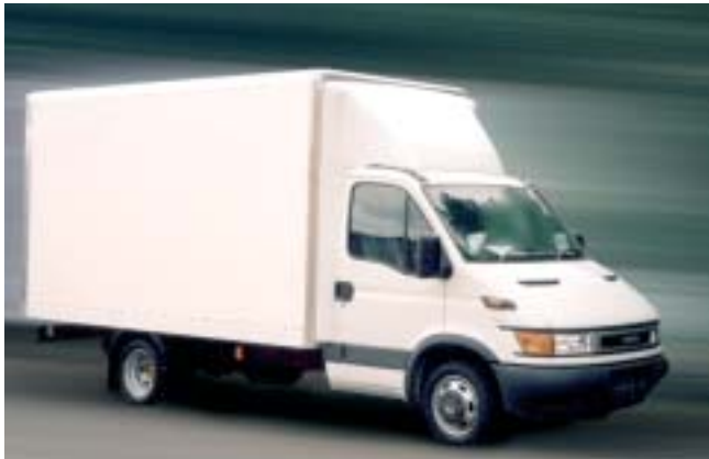
Daily 35C12 & 65C15 BOX VANS