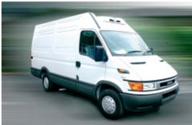
Daily 35S12 12m³ CHILLER VAN