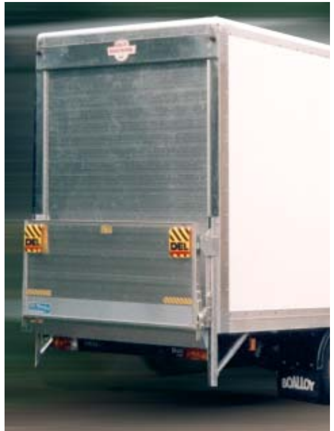
TAIL LIFT OPTION