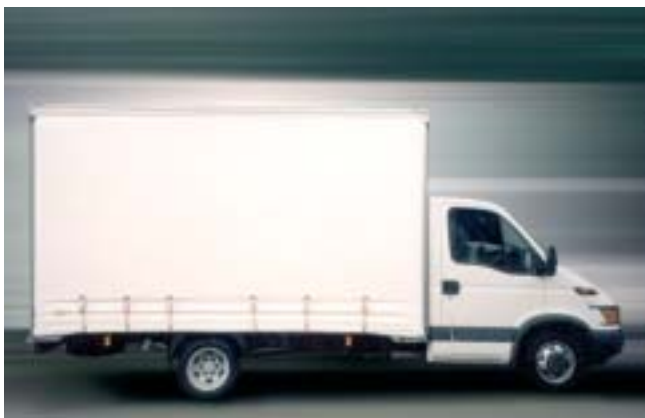
Daily 35C12 & 65C15 TAUTLINERS