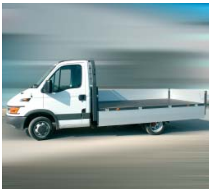
DROPSIDE SINGLE CAB

In 2001 Ingimex moved to a new purpose-built factory in Telford which has enabled them to increase production capacity and provide customers with a better service from design through to after sales support. In 2004 the Ingimex DriveAway range was increased to include the crew cab TITAN steel tipper model.