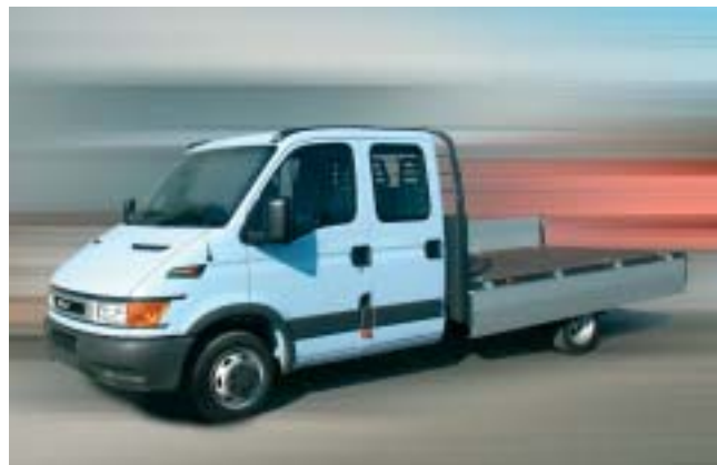
Daily 35C12 CREW CAB DROPSIDE