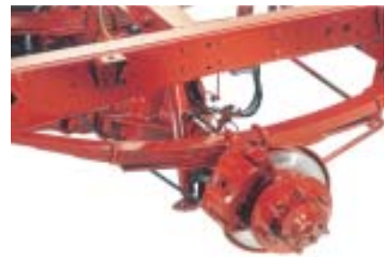
Multi-leaf rear suspension