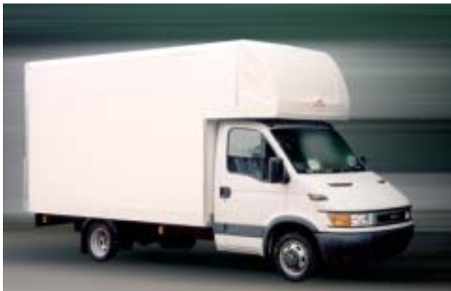
Daily 35C12 & 65C15 LUTON VANS