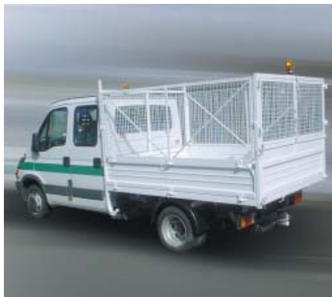
REAR or 3-WAY TIPPER with CREW CAB