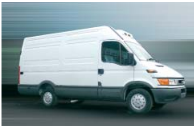
Daily 35S12 12m³ FREEZER VAN