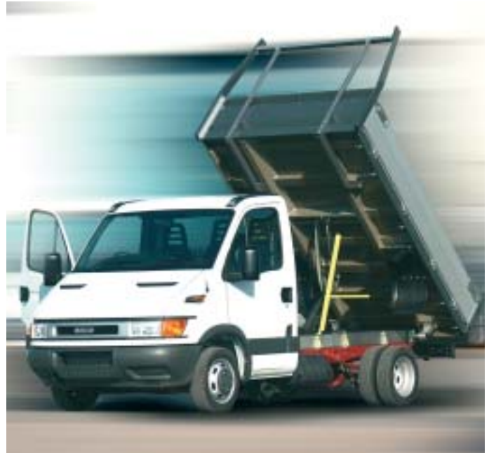
3.5 TONNES TIPPER