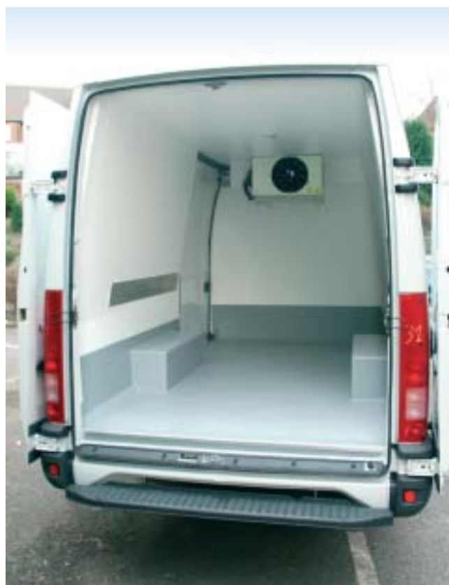
INTERIOR OF REFRIGERATED VAN

GRP Group pioneered the first refrigerated van in 1973 and has developed a reputation as a specialist provider in temperature controlled conversions. GRP has nationwide coverage from three centres at Leeds in West Yorkshire, Westbury in Wiltshire and Glasgow. By combining in-house design experience, together with substantial panel construction and body building experience for all types of vans, GRP are able to deliver the maximum payloads possible for customers.