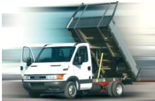
Daily 35C12 TITAN STEEL TIPPERS