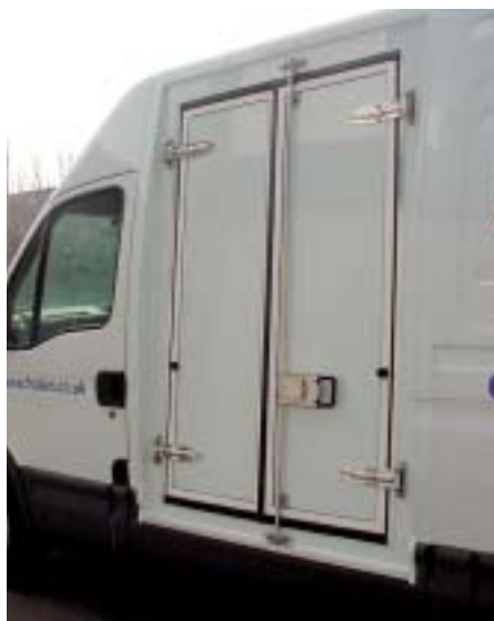
OPTIONAL FREEZER DOUBLE PLUG SIDE DOOR

The chiller and freezer vans are both based on the Daily 35S12 van featuring the latest 2.3 litre common rail injection 116hp engine. Drivers will welcome the car like, quiet and fully trimmed cab and, when on delivery rounds the cross cab access to the nearside door. Effortless and safe handling is assured by independent front suspension, power steering and power assisted disc brakes.