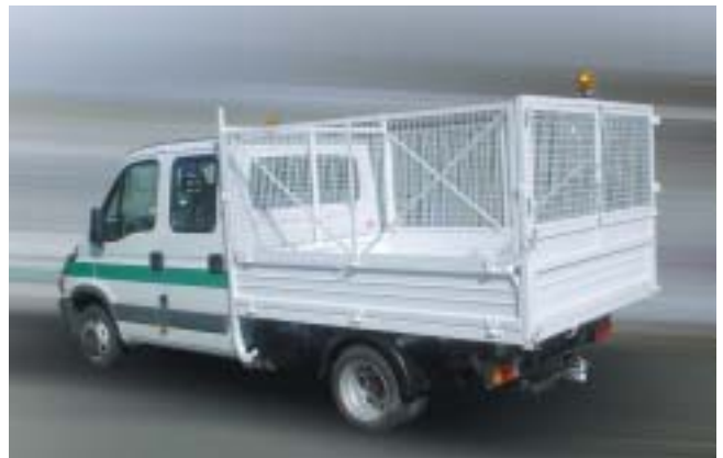
Daily 35C12 REAR or 3-WAY STEEL TIPPERS with CREW CAB