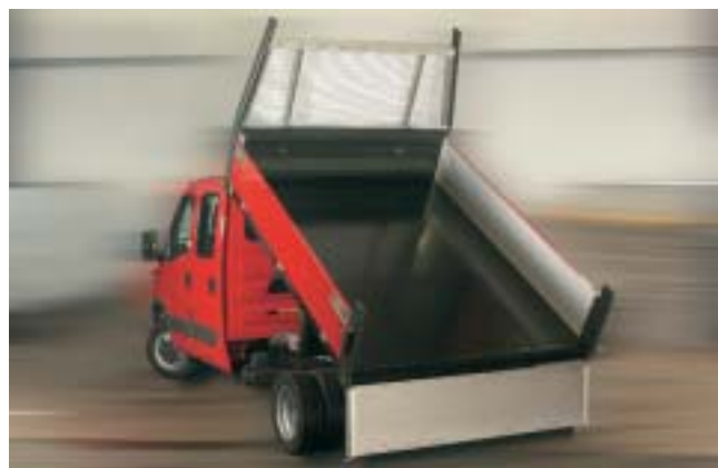
Daily 35C12 TITAN STEEL TIPPER with CREW CAB