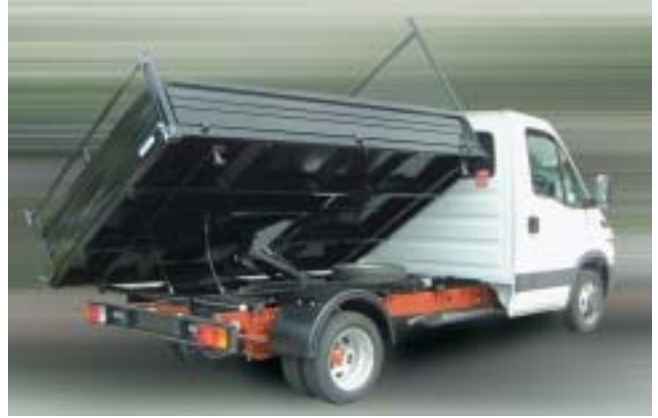
Daily 35C12 REAR or 3-WAY STEEL TIPPERS