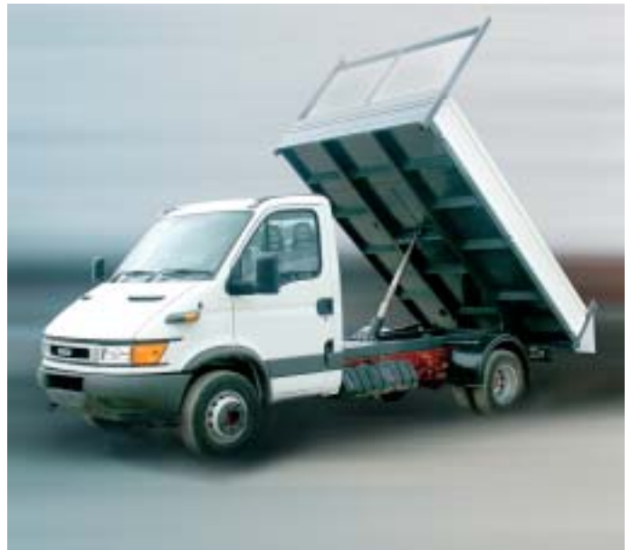
DriveAway 65C15 REAR STEEL TIPPER

A new lightweight 3-way tipping mechanism means improved payload capacity. Powder coated finishes are standard across the range reducing corrosion in the event of mechanical damage.